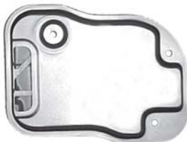
72605 Similar to 72600L, 72604 & 72605B Note Differences in Pickup Area