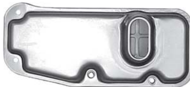
72603A Similar to 72601B with Different Mounting Holes