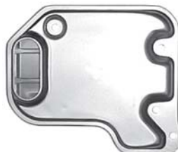
72605B Similar to 72600L, 72604 & 72605 Note Differences in Pickup Area